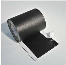
EPDM with 1 of 2 butyl adhesives