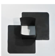
Preformed inside and outside EPDM corners