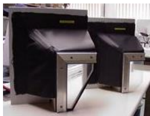
EPDM customized according window dimension