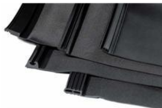
EPDM provided with an extruded EPDM-profile according window frame